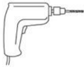
M6 drill bit