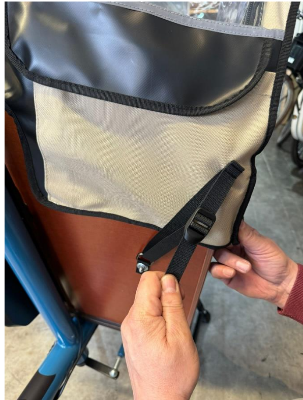
Also on the right side