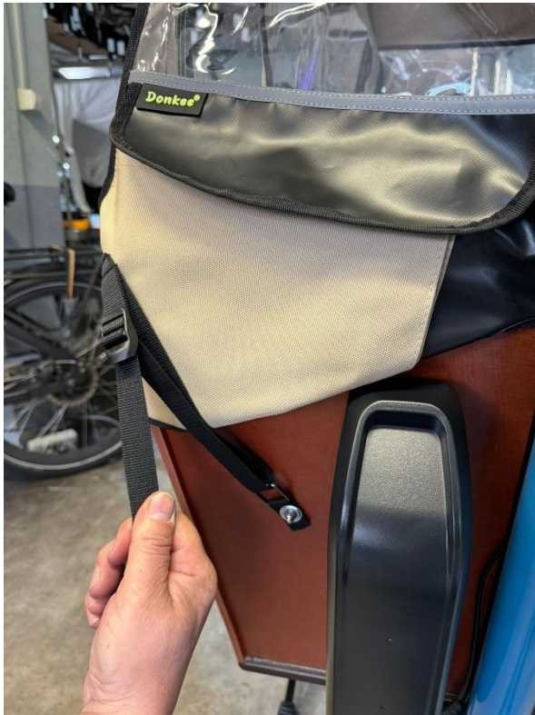
Now fasten the buckles at the back near the handlebar side as shown