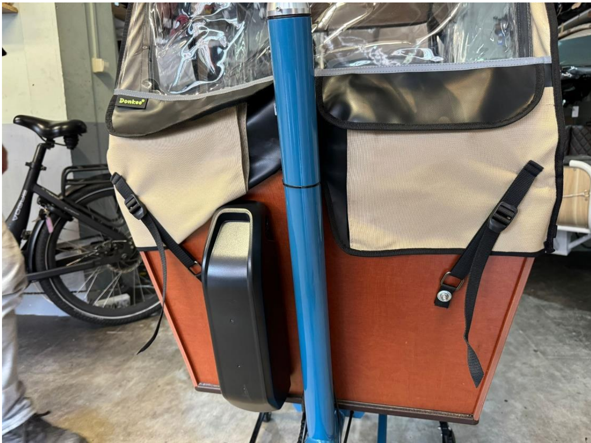
This is what it should look like.